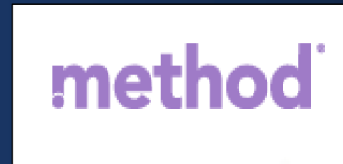
Method Cosmetic Products