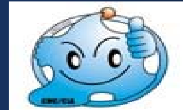
CMC/CLA Auto Parts Supplier