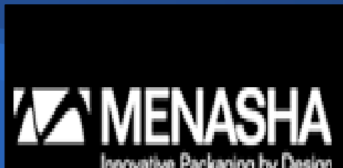
Mensha Machinery Manufacturer