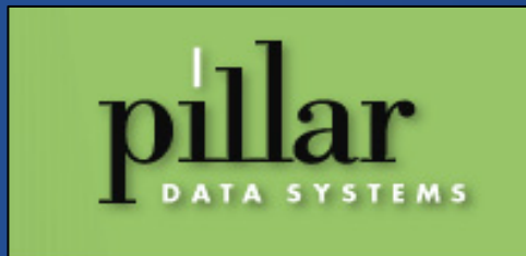
Pillar Data Servers and Network Devices