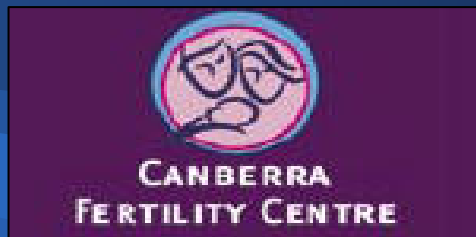
Canberra Fertility Center Hospital