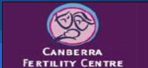
Canberra Fertility Center Hospital