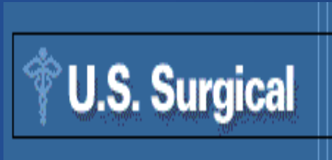
A Division of Tyco Medical Devices