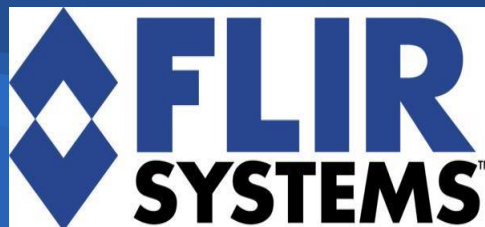
FLIR System Defense